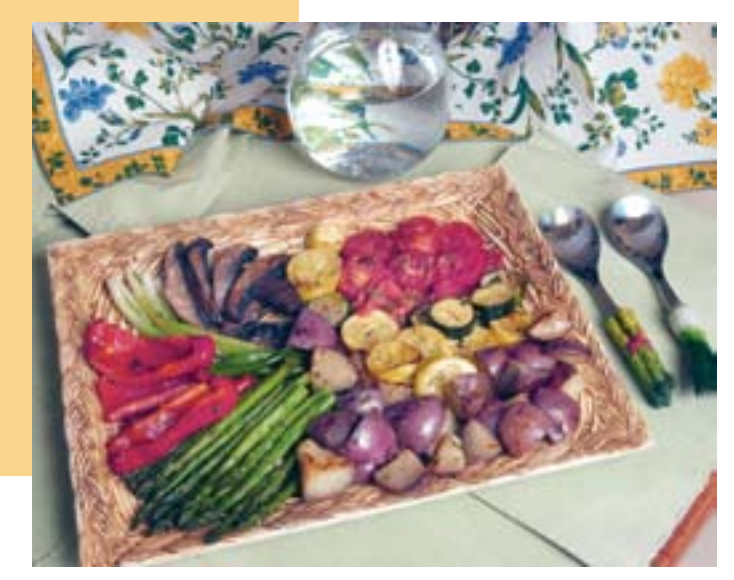
Accessories courtesy of the Hartford Hospital Auxiliary Gift Shop.

The "Mediterranean diet" appears to reduce the risk of coronary disease in people who replace saturated fat with olive oil. The Food and Drug Administration (FDA) says "limited and not conclusive" evidence suggests that a couple of tablespoons of olive oil containing monosaturated fat may reduce the risk of coronary heart disease if it replaces a similar amount of saturated fat. The FDA has changed its stance on low-fat foods, recognizing that some fats are key ingredients in a healthy diet.